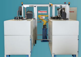
ARL SMS-3500 with 2 ARL iSpark in parallel

For unattended on-site analyzes, these systems can be supplied in a standard container: the Thermo Scientific™ ARL™ QuantoShelter, also called “the lab in a box.”