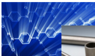
Polymers / Biomaterials