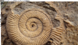
Environment / Geology