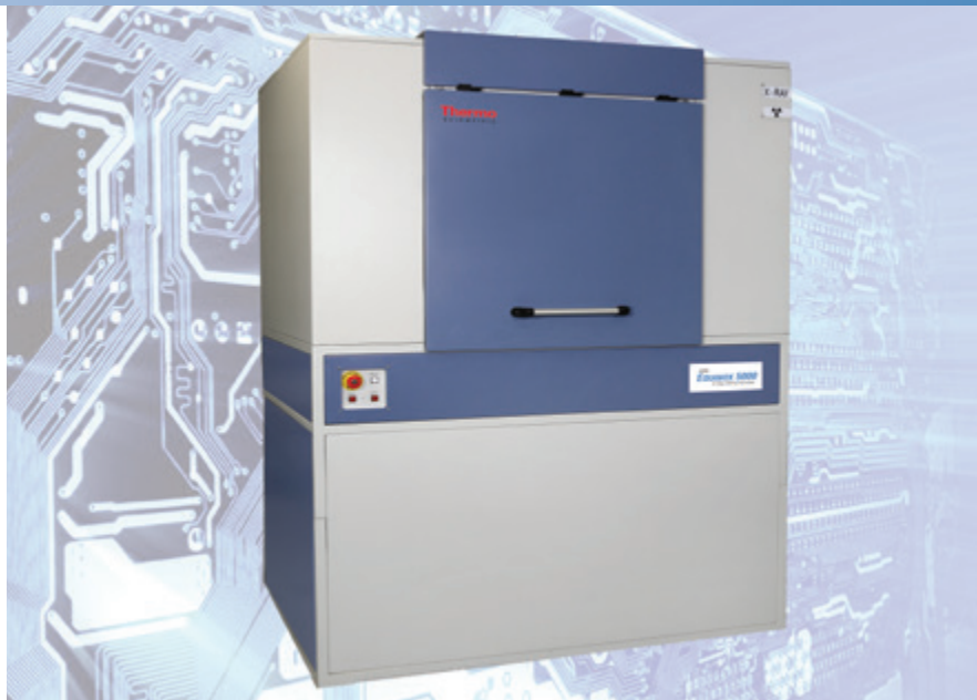
Perfect for advanced research applications.

The system utilizes a unique tall vertical goniometer in \theta/\theta or \theta/2\theta mode and the user has a large choice of features including higher resolution detectors and a large choice of X-ray sources. The free space in the sample compartment is very large and will accommodate practically any sample and any sample handling device including furnaces, auto samplers, and large assemblies.