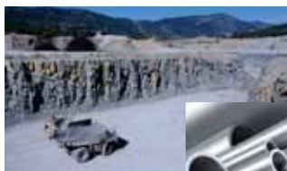
Geology, Cement, Mining